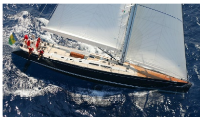
Southern Wind 78'